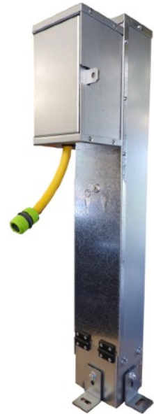
Above ground Section